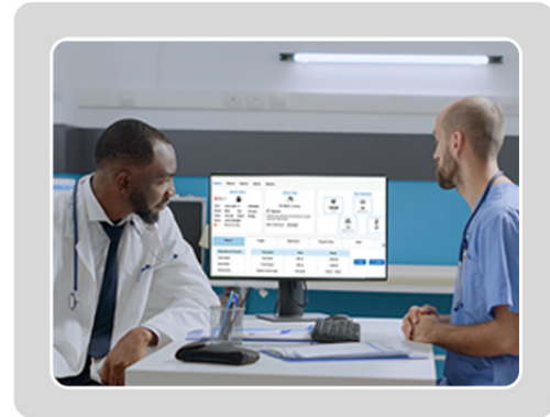
Remote View and Management