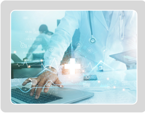
Unified Patient Dashboard